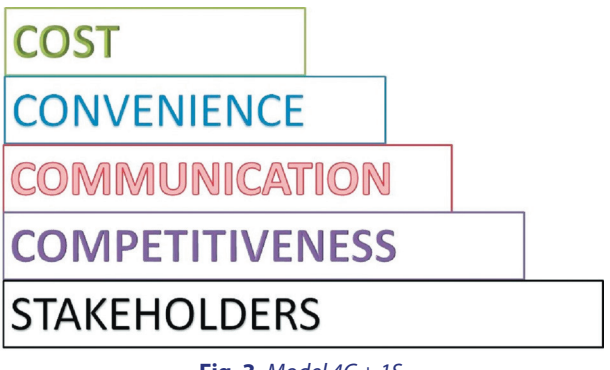
Fig. 3. Model 4C + 1S

The first three elements are similar to the 4C model: